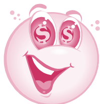
Need $ for College?

The Foundation for Rural Service (FRS), through its partnership with the National Telecommunications Cooperative Association (NTCA) promotes, educates, and advocates to the public, rural telecommunication issues in order to sustain and enhance the rural way of life throughout America. Through its various programs the foundation strongly supports the continuing education of rural youth.