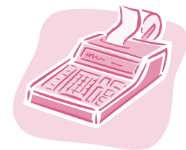
Capital Credits and Income Taxes

The Internal Revenue Service requires Federated Telephone to provide 1099 forms to all customers who received a refund of $600 or more.