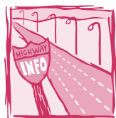
Know the Road

"Federated Telephone will sponsor one high school Junior from our Cooperative to attend the FRS Youth Tour."